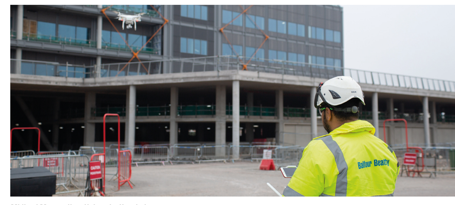
Midland Metropolitan University Hospital

We also refreshed our Cultural Framework<sup>4</sup> in December 2020. Our Cultural Framework sets out our purpose, values and behaviours. It supports our business decisions, investments and actions and is embedded in our operations and our business processes. Our approach to modern slavery is aligned to these two documents.