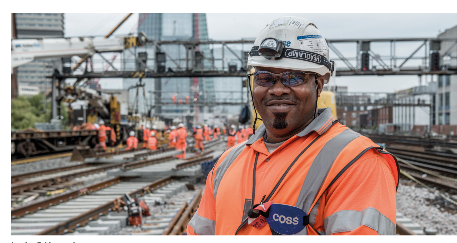
London Bridge station