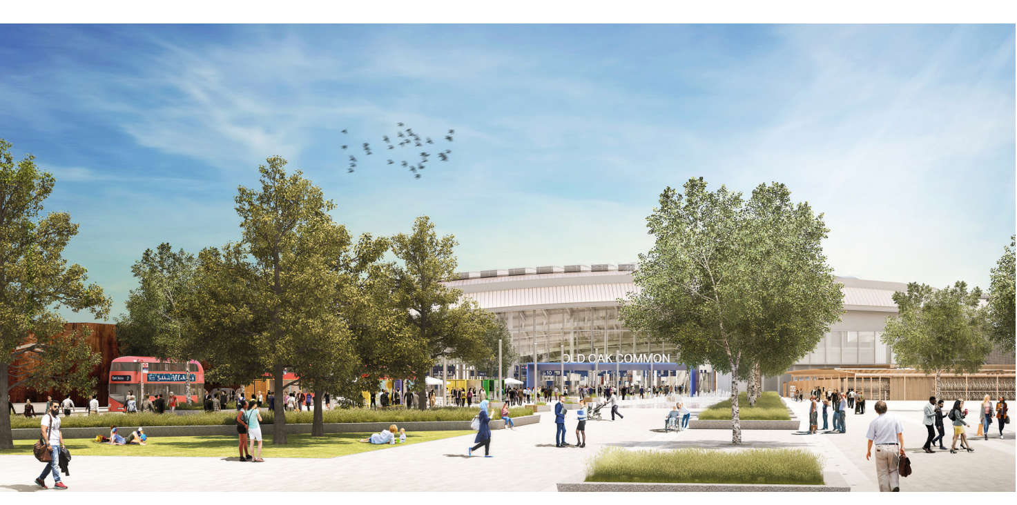
Old Oak Common station

To further develop this approach in 2021, we are seeking to implement similar checks on a wider number of sites. This would be integrated into a new site induction system. Integrating it into a tool being used across the business would ensure that more of our projects and their workers receive the checks. Currently we are only planning to do this where we are able to use the group site access control system, but some customers request that different systems are used. Currently, we are not able to integrate modern slavery checks into all site access control systems used.